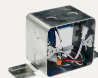
EML-JB-AC2 (Sold Separately)