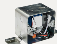
EML-JB-AC2 (Sold Separately)