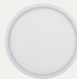
RDLE w/EMTB (Test Switch)