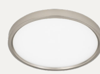
BN- Brushed Nickel