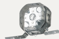
4" Octagon / V Bracket